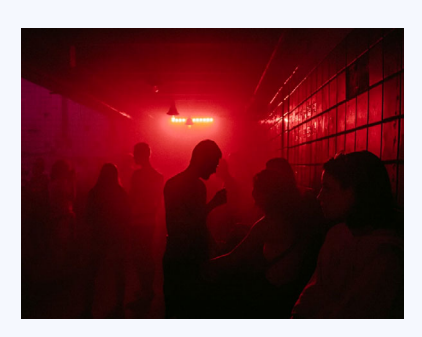
Yes, you can rave!