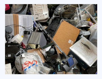
The rental service minimize wastes and maximize the usage of the products