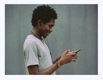
Only pay for how much you need